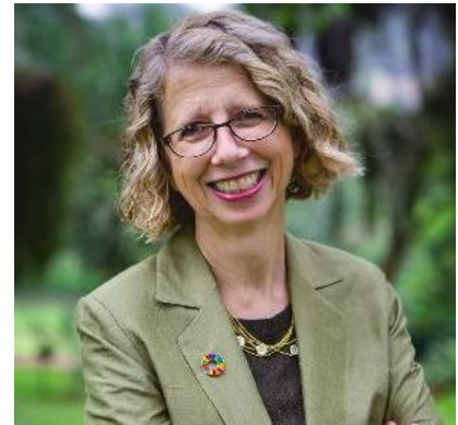
Ms. Inger Andersen, Under Secretary-General of the UN and UNEP Executive Director